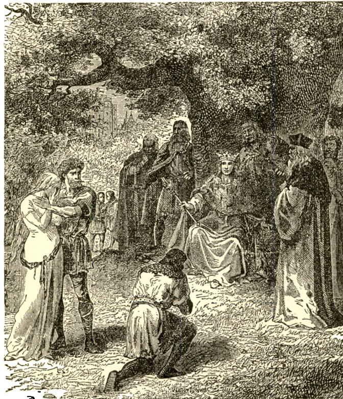
SAINT LOUIS SITTING IN JUDGMENT.